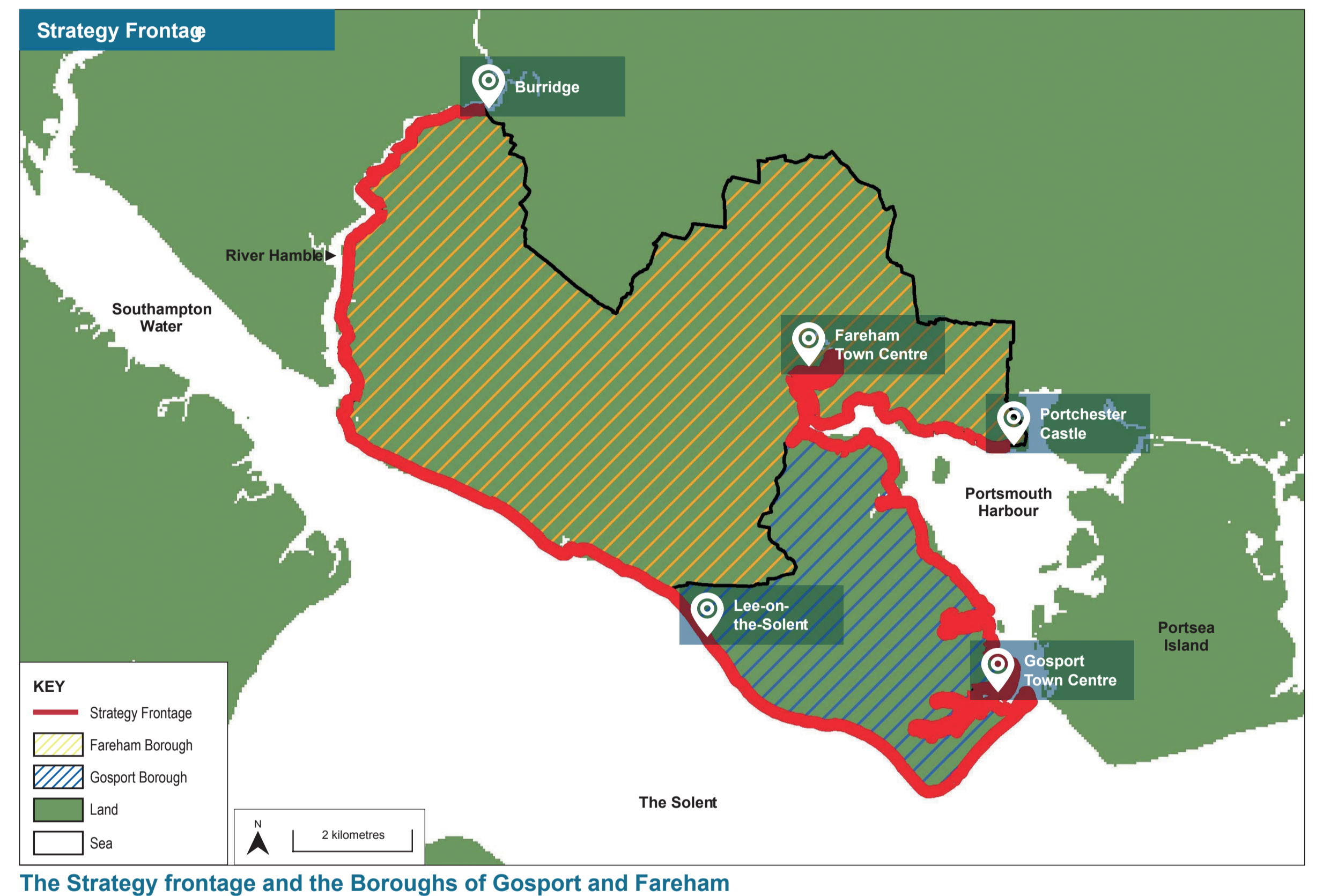
The Strategy frontage and the Boroughs of Gosport and Fareham